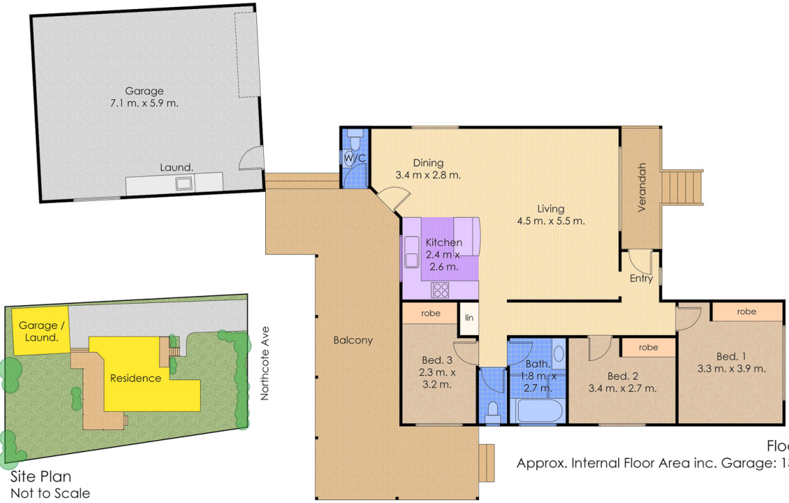
Floor Plan Approx. Internal Floor Area inc. Garage: 131 sqm.