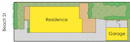
Site Plan Not to Scale