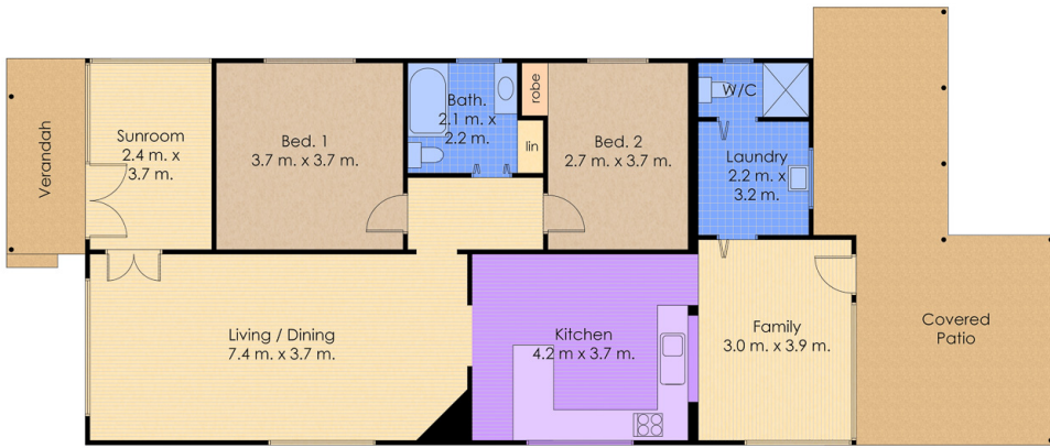
Floor Plan Approx. Internal Floor Area: 126 sqm.