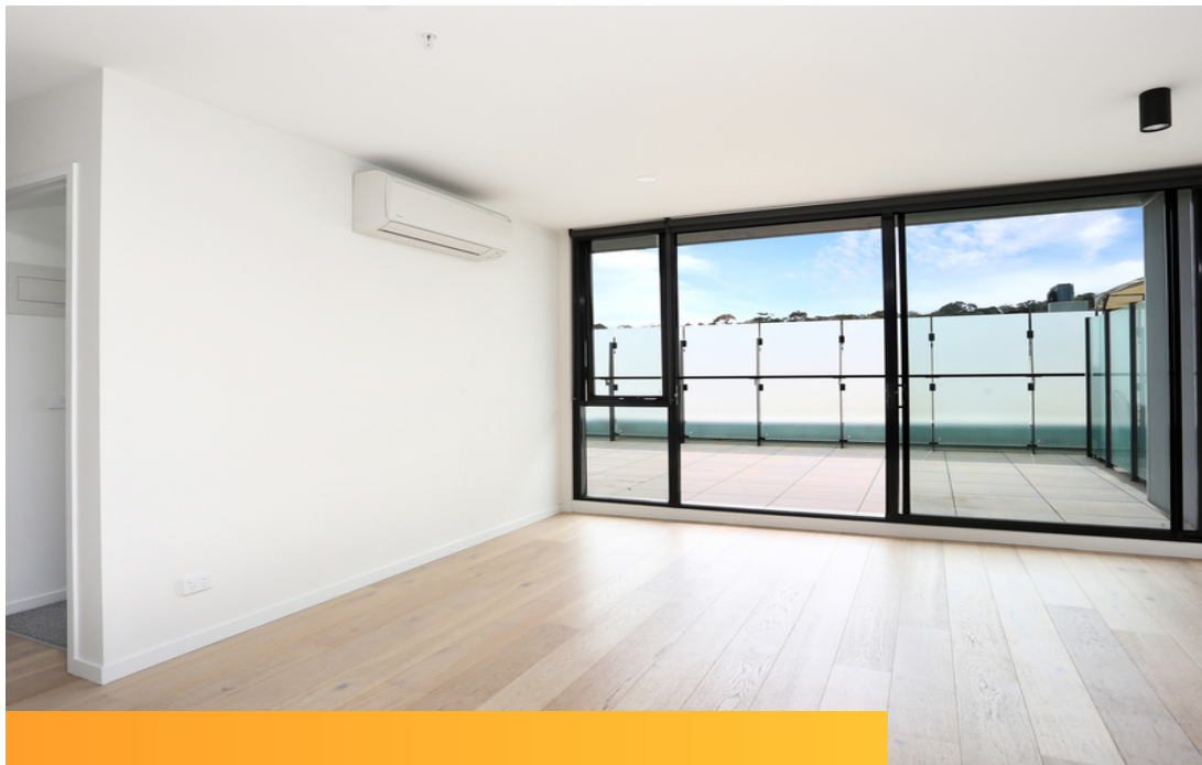
Huge Northerly Balcony