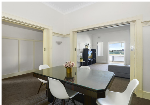
Actual view from master bedroom

Lifestyle & Location with Stunning harbour views