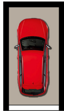
L. U. GARAGE

This diagram is for illustrative purpose only. All reasonable care has been taken in the preparation, but no warranty is given to the accuracy of the information. This document does not constitute any part of any offer or contract. Dimensions shown are approximate only. Prospective purchasers must rely on their own enquiries.