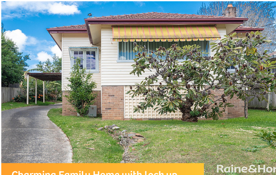
Charming Family Home with lock up garage