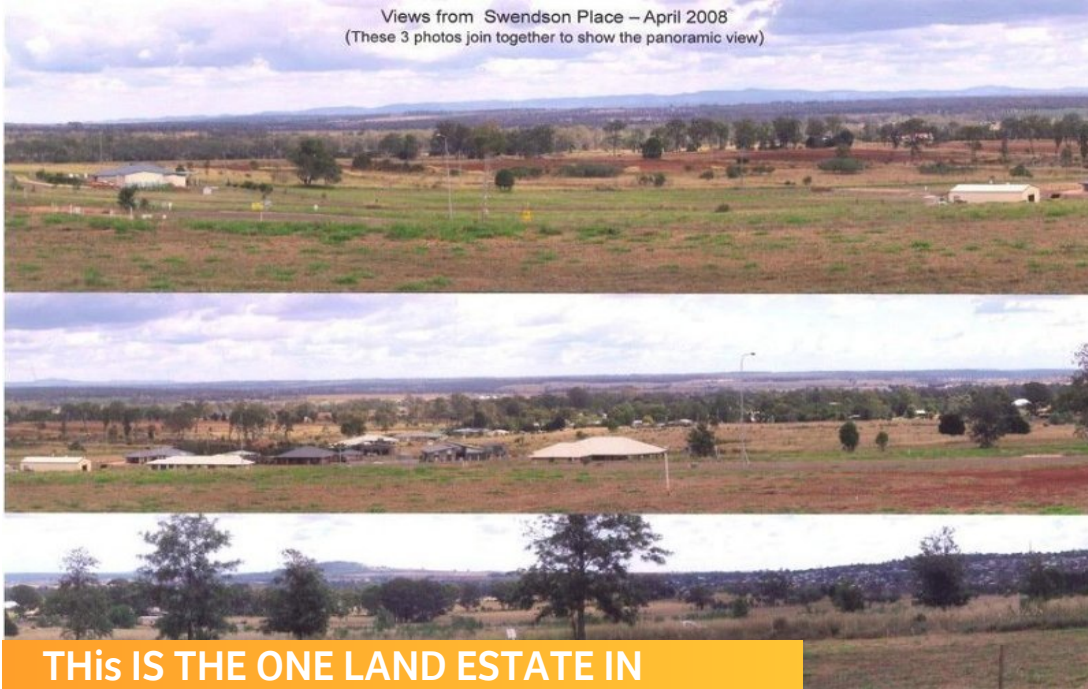
Views from Swendson Place – April 2008 (These 3 photos join together to show the panoramic view)