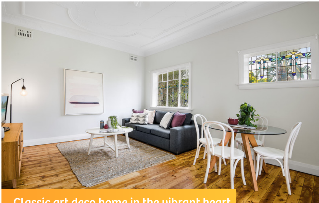
Classic art deco home in the vibrant heart of Marrickville