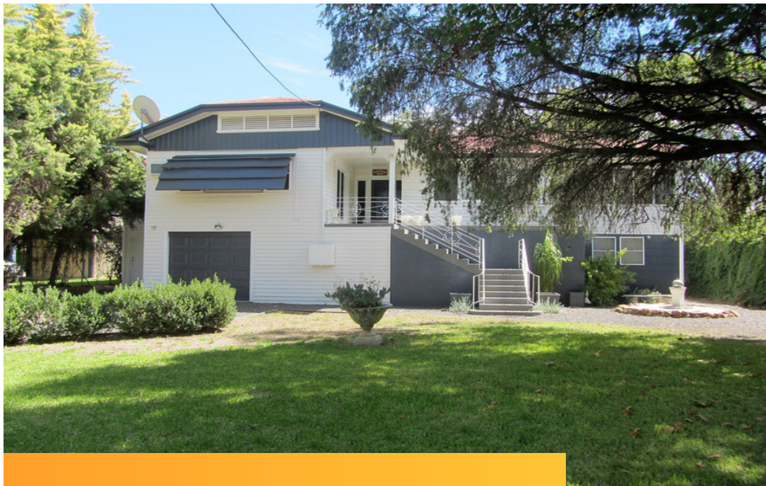
Dress Circle Position