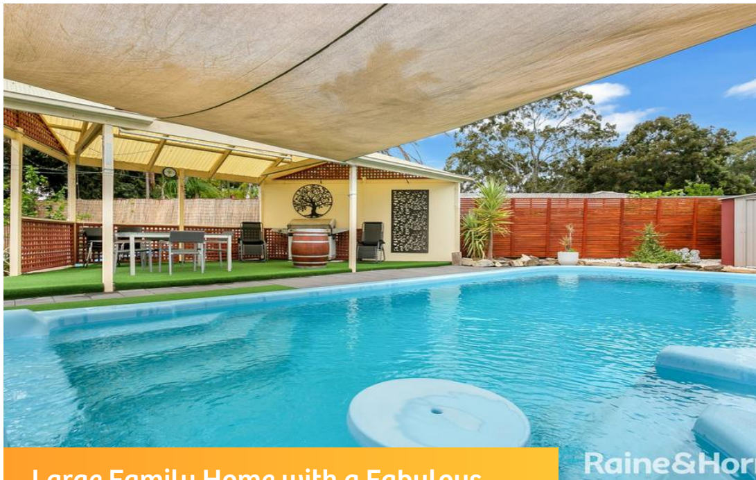
Large Family Home with a Fabulous Inground Pool!