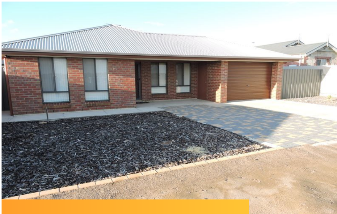
Neat Family Home