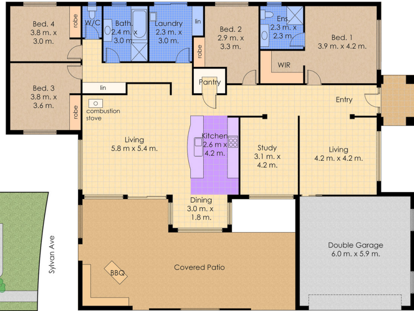
Floor Plan Approx. Internal Floor Area: 228 sqm.