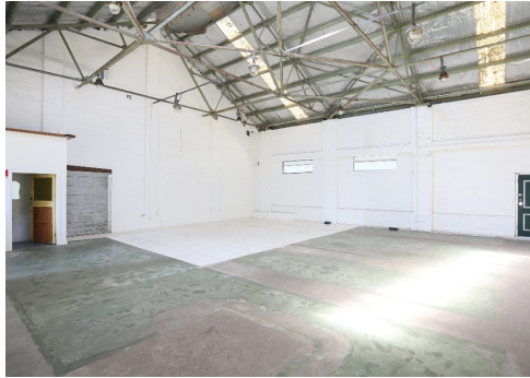
TIGHES HILL 73B Elizabeth St