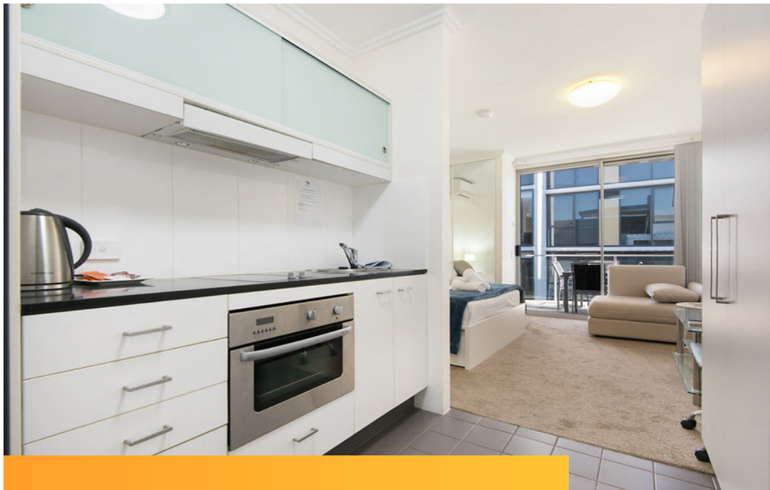
Lovely Studio Apartment