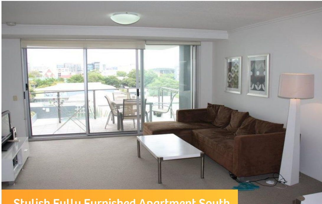
Stylish Fully Furnished Apartment South Bank Area, Great Views