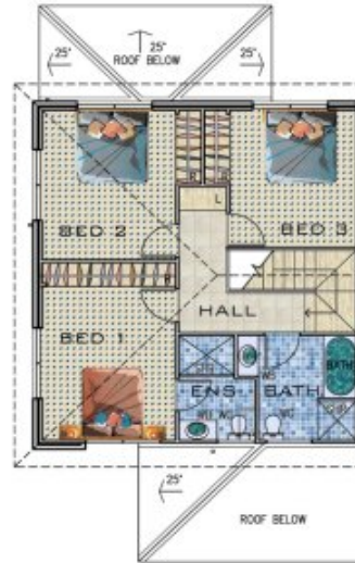
FIRST FLOOR SCALE 1:100