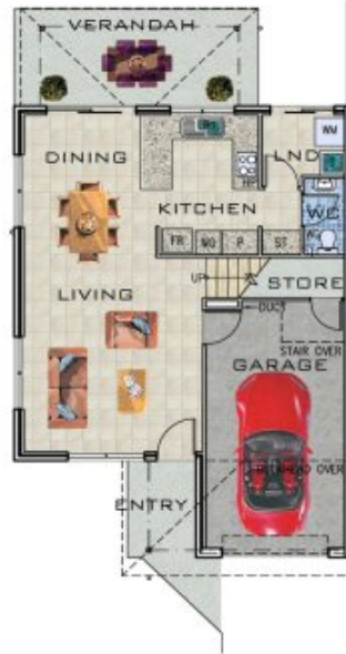
GROUND FLOOR SCALE 1:100