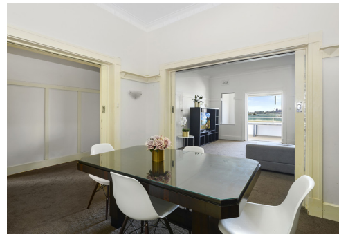
Actual view from master bedroom