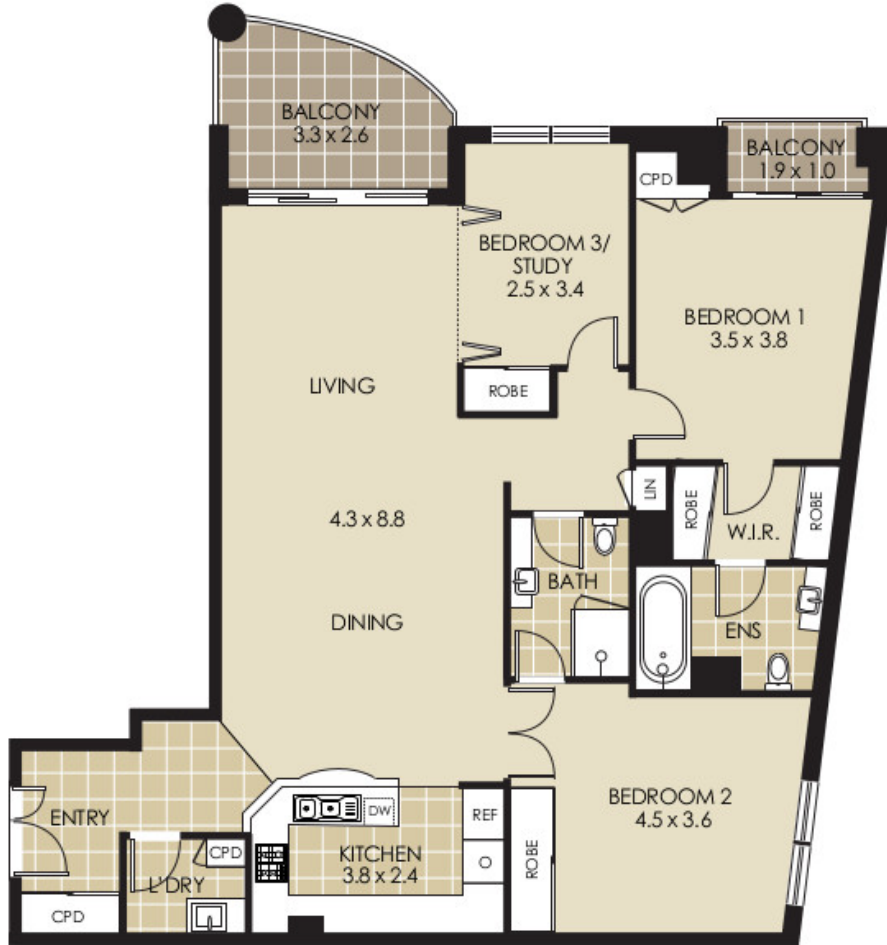
APARTMENT FLOOR PLAN