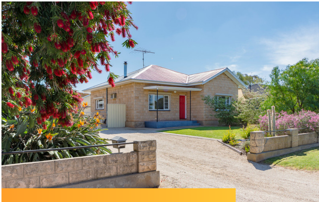
"Fabulous 50's on Fennell"