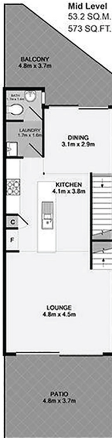
Mid Level 53.2 SQ.M. 573 SQ.FT.