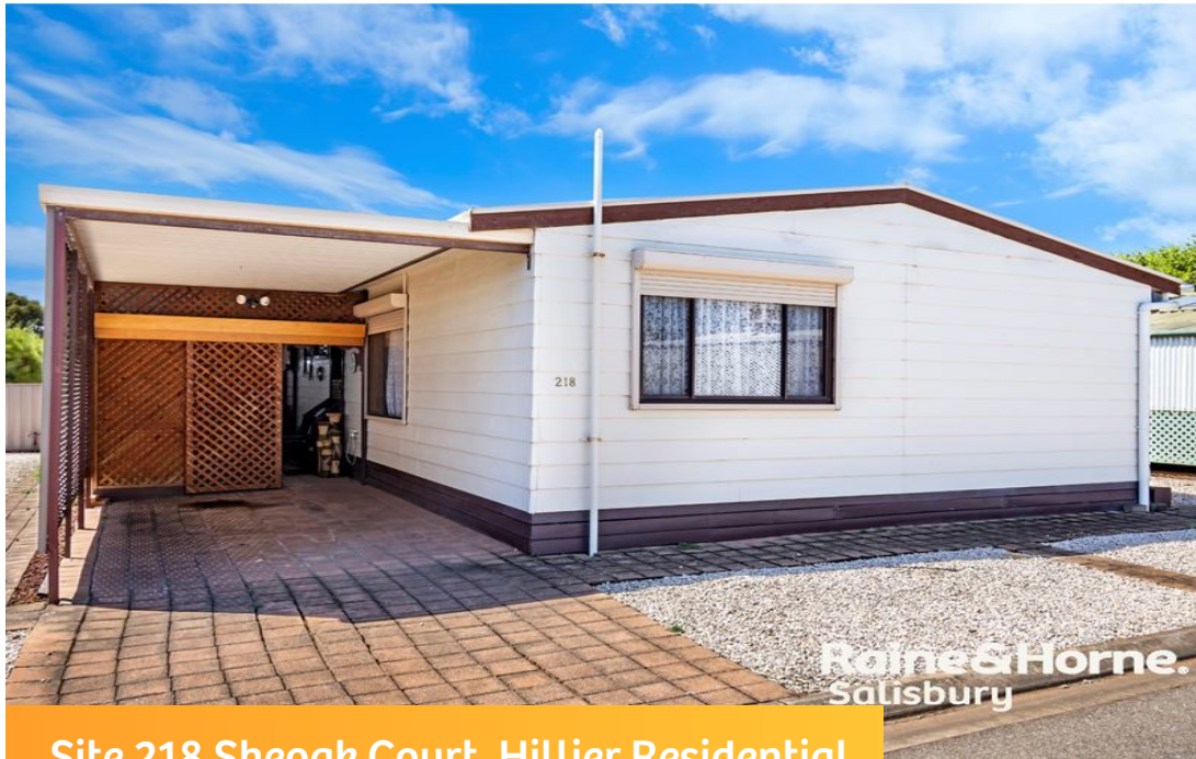
Site 218 Sheoak Court, Hillier Residential Park