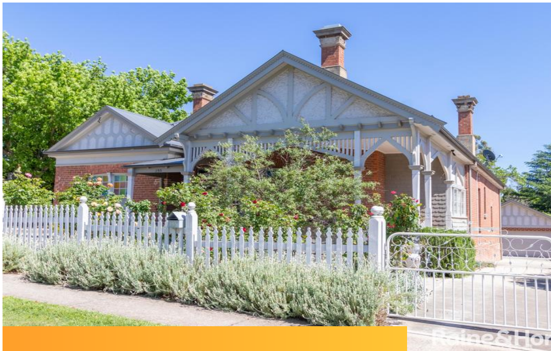
"BIWA" CIRCA 1903