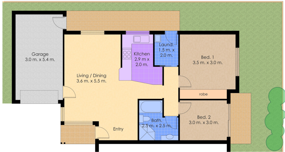
Floor Plan Approx. Internal Floor Area: 84 sqm.